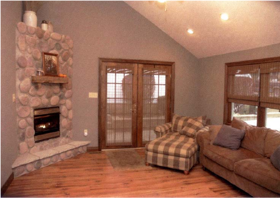
The family room shown to the left is part of a CotY-winning project in the Residential Addition $100,000 to $250,000 category by Brentwood Builders. The addition included a wheelchair-accessible shower for the homeowners' handicapped son.