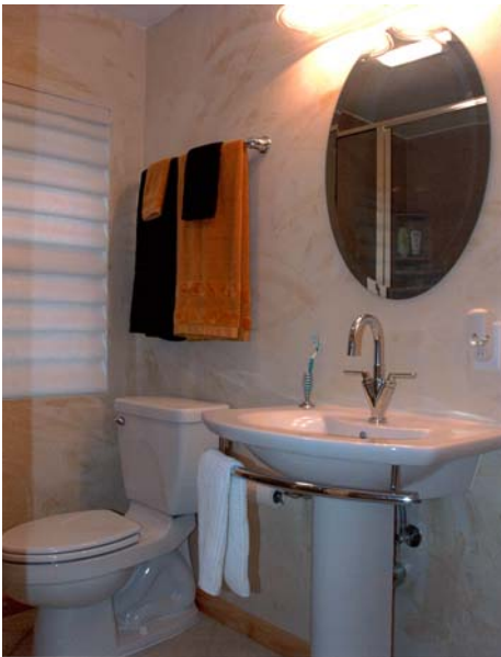
Hurst Total Home remodeled a bathroom straight out of the 1960s, creating a bath with a contemporary look, shown above, and earned a CotY award in the Residential Bath $15,000 to $30,000 category.