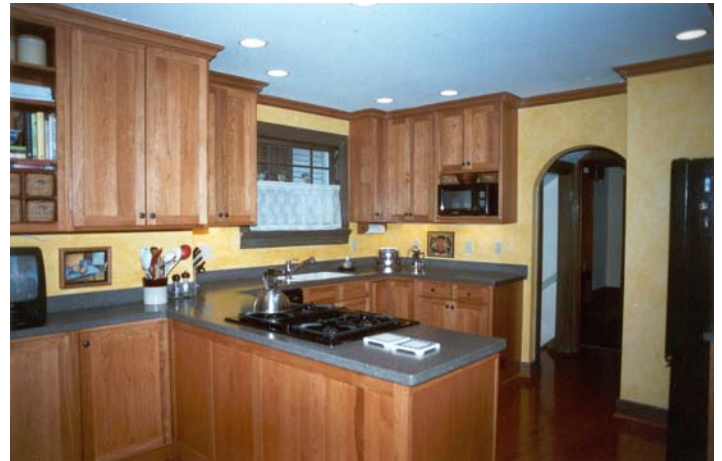
Main Street Construction completed the project in the above left photo, which won CotY honors in the Residential Kitchen $15,000 to $30,000 category. The original kitchen dated from the 1940s. To build the kitchen in the righthand photo above Home Towne Construction removed a wall to open the kitchen into a totally separate nook area. This job earned CotY honorable mention in the Residential Kitchen $30,000 to $60,000 category.